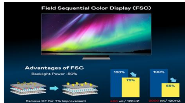
Fig. 3 Low Power Consumption Display - FSC

Besides, AUO introduced HiRaso, a reflective bistable display technology based on CHLCD, characterized by low power consumption, wide temperature operation, and shock resistance, making it ideal for transit and outdoor public information displays. AUO has developed a comprehensive sustainability roadmap for 2030, aiming to reduce overall power consumption by 65% and ensure 100% use of recycled materials in new products. In addition to material innovations, AUO is also focusing on advancing high efficiency backlights and low power IC technologies to support sustainable consumption and further promote environmental responsibility.