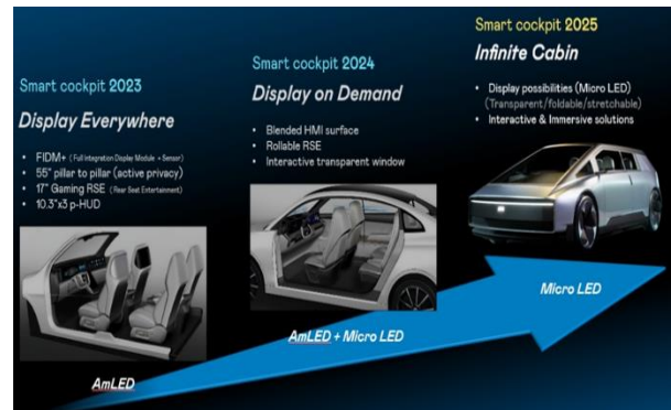
Fig. 2 AUO's Smart Cockpit Evolution

grain textures, AUO aims to enhance the aesthetic appeal of vehicle interior.