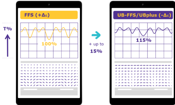
Figure 1. UB-FFS versus FFS Transmittance

edges of the electrodes. The increased transmittance and, consequently, the higher bright state make UB-FFS an effective solution for enhancing the ambient contrast ratio of LCD displays in environments where ambient light is present.